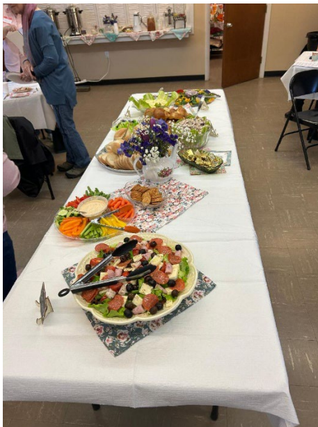
Examples of our delicious luncheon.